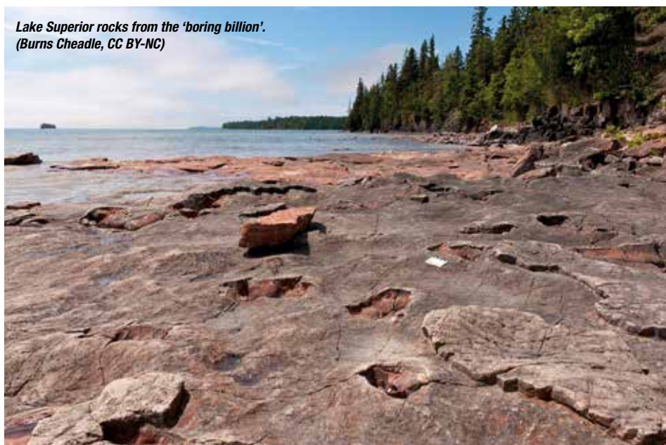
Lake Superior rocks from the 'boring billion'.